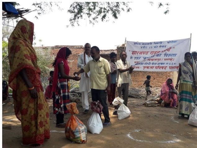
Palamu @ Saraju : A natural channel for water

flow cleaned during the Shramdan camp organized by the Ekta Parishad in Pichhari village of Koderama district in Jharkhand. Now, villagers will access the clean and sufficient water. Also villagers brought out the soil from the channel which was filled in silting.