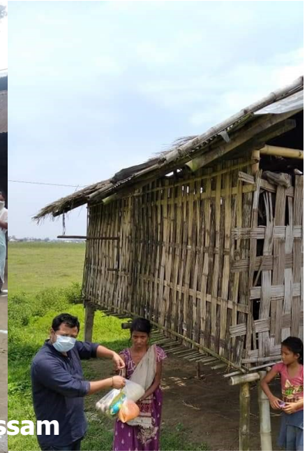
Food materials served in Assam

Assam: Ekta Parishad distributed dry food like rice, pulses, potato, salt among 50 migrants families of Ratanpur, Panikhaiti, Bitutari, Gumi, Sapaortari, South Pantan panchayat of Chhayagaon and Rampur block of Karmrup district. 28 migrant laborer's families were provided food materials in Dirak, Amguri, Chumoni, Laina, Khatowa village of Tinisukia district. In Demaji district, Also 43 families of 4 villages provided food materials in Bhebeli and Bardolini village Panchayat. According to Dimbeshwar Nath, all these migrant laborers were selected on the basis of their economic situation and they have returned recently from other places. Social distance maintained at the time of distribution.( Source: Nayan Tara)