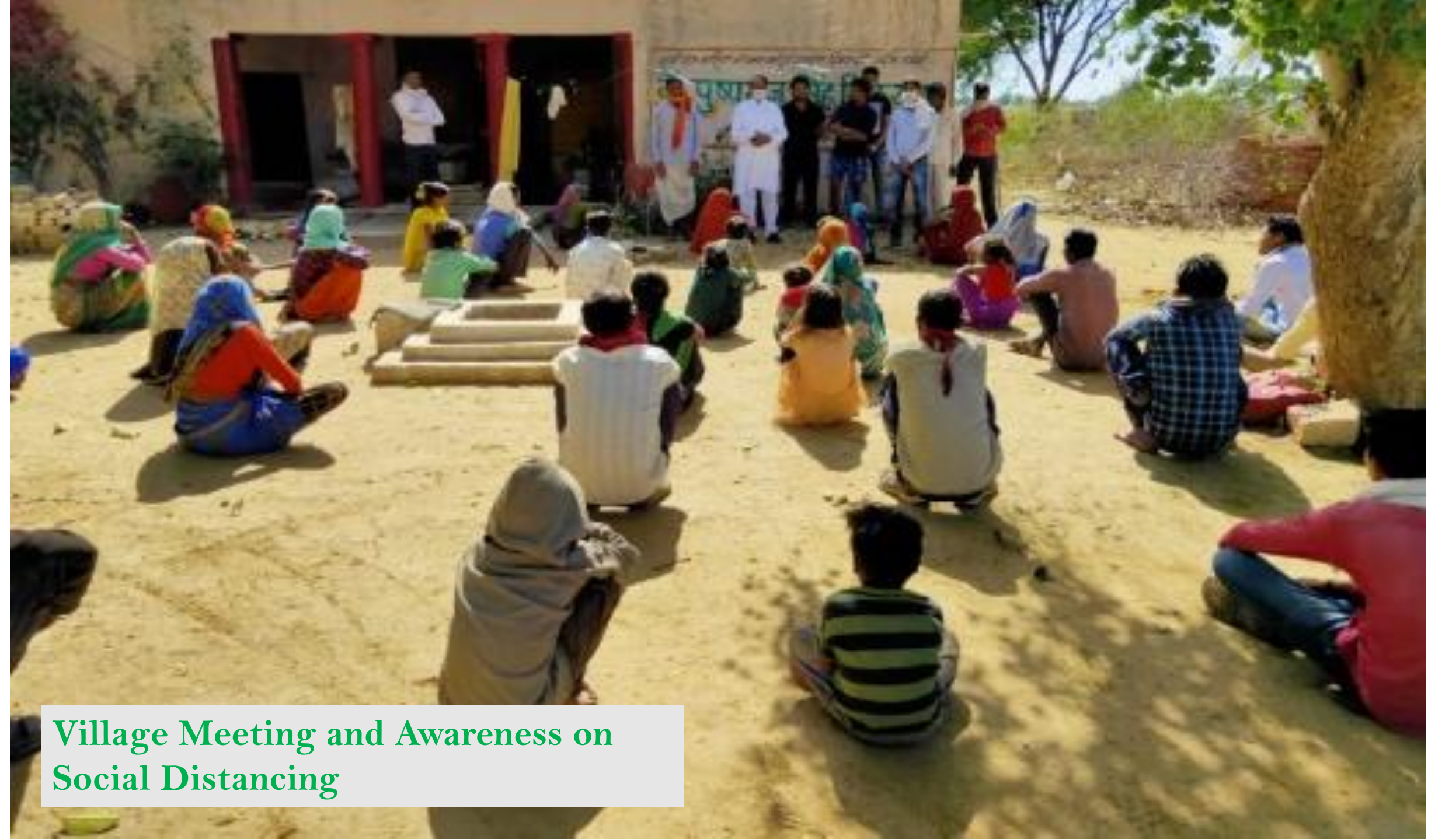
Village Meeting and Awareness on Social Distancing