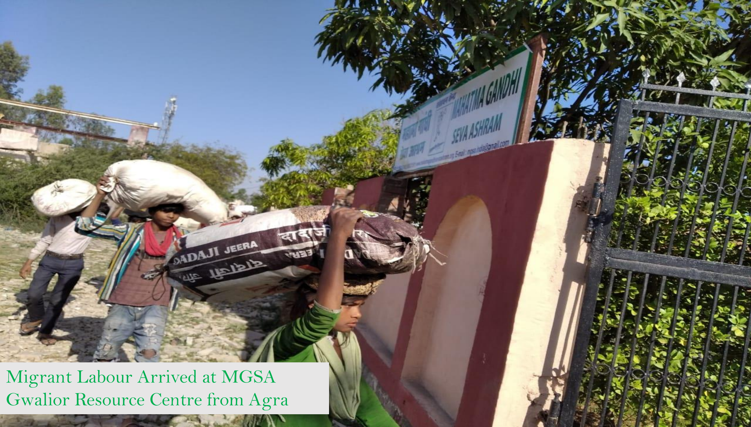
Migrant Labour Arrived at MGSA Gwalior Resource Centre from Agra