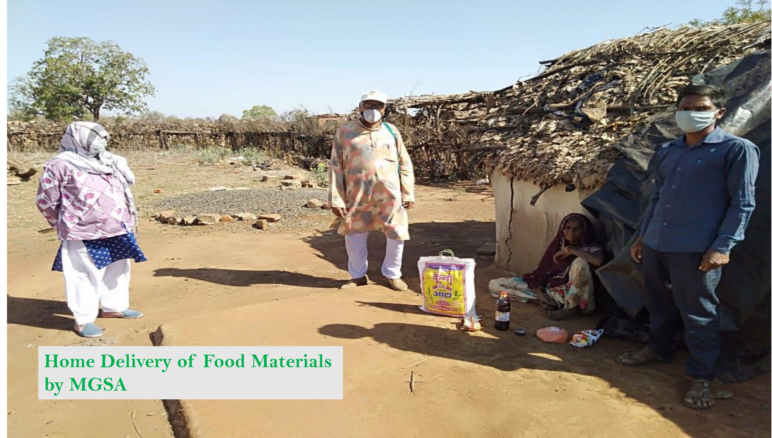
Home Delivery of Food Materials by MGSA