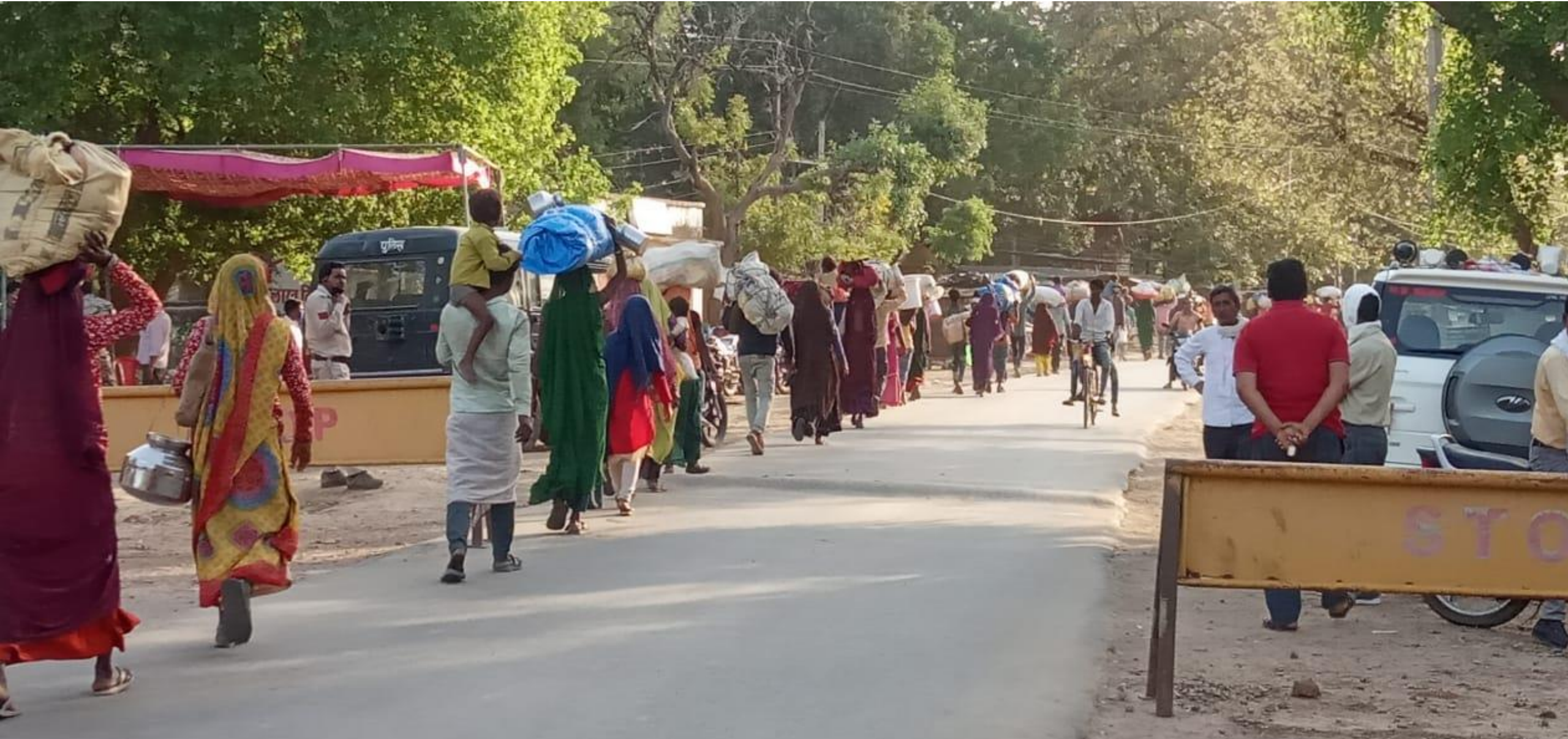
Migrant Labour returning their respective villages from Agra to Birpur, Sheopur District, Madhya Pradesh.