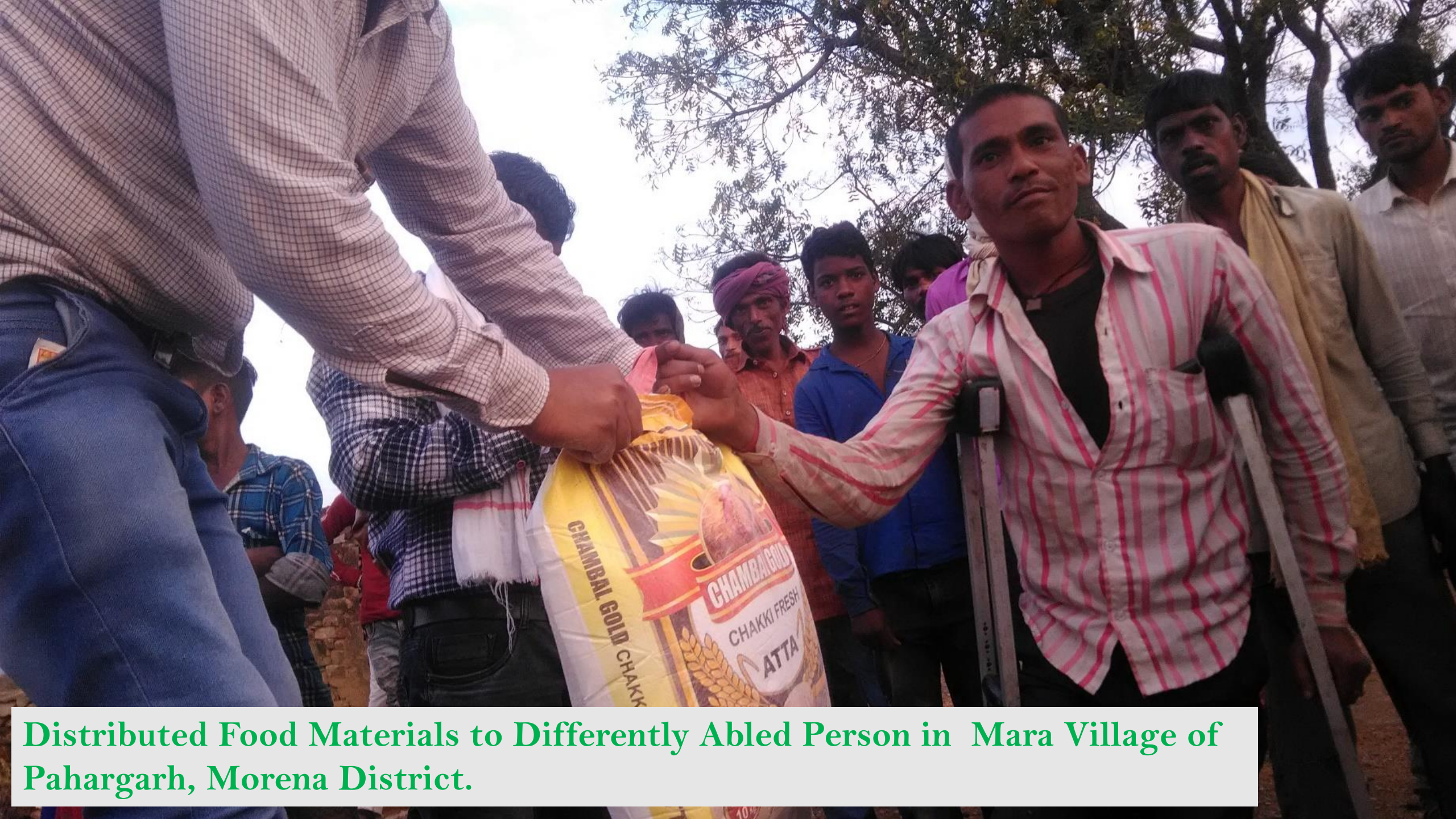
Distributed Food Materials to Differently Abled Person in Mara Village of Pahargarh, Morena District.