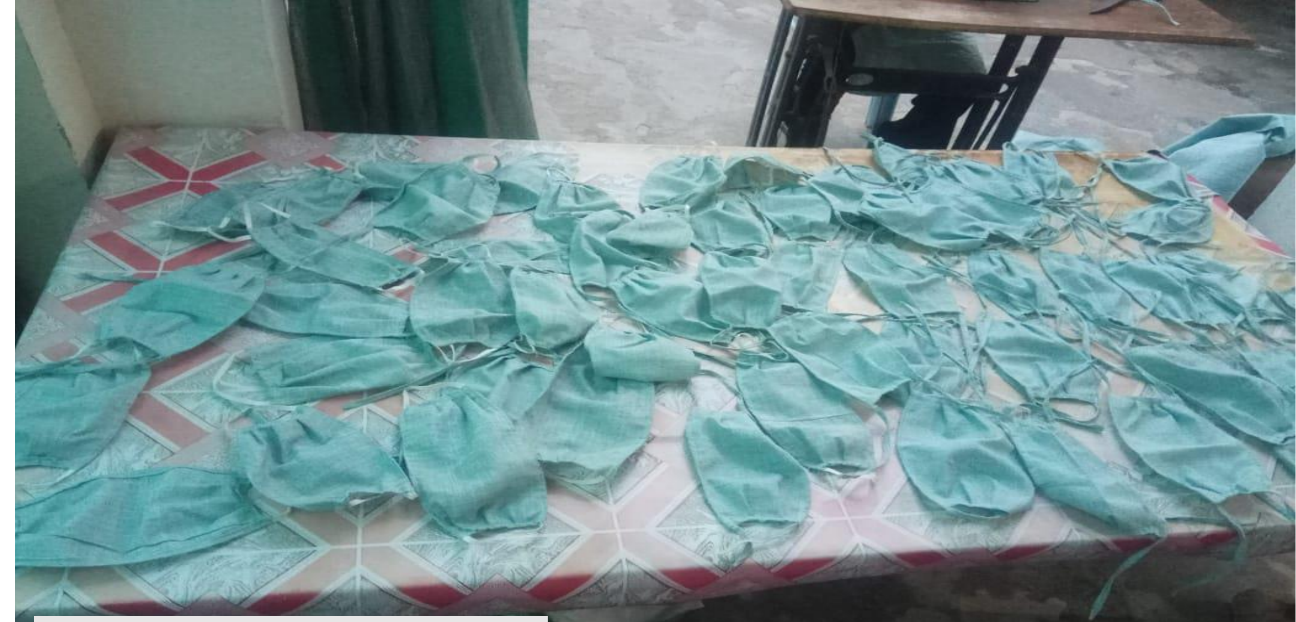
Preparation Distribution of Mask