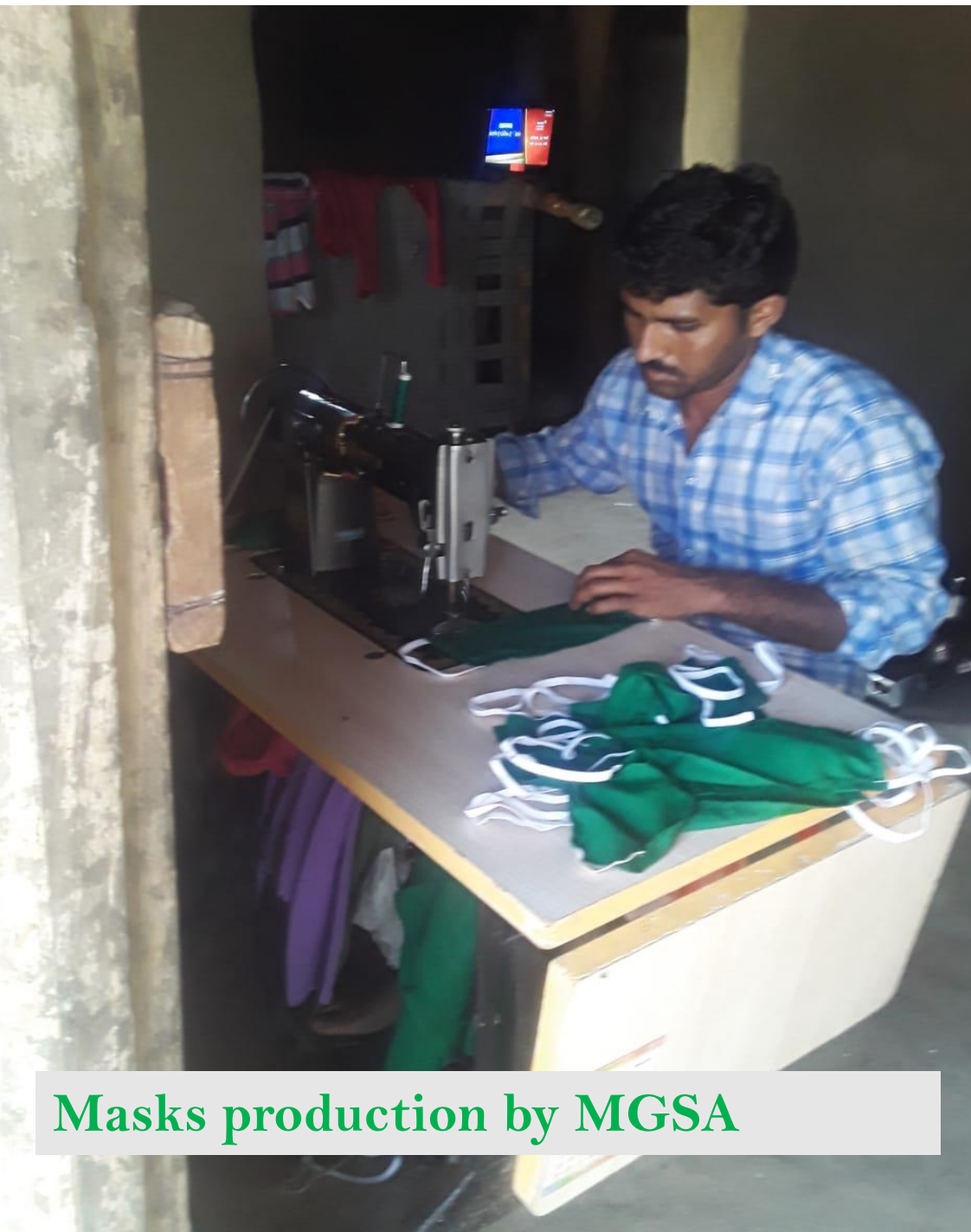
Masks production by MGSA