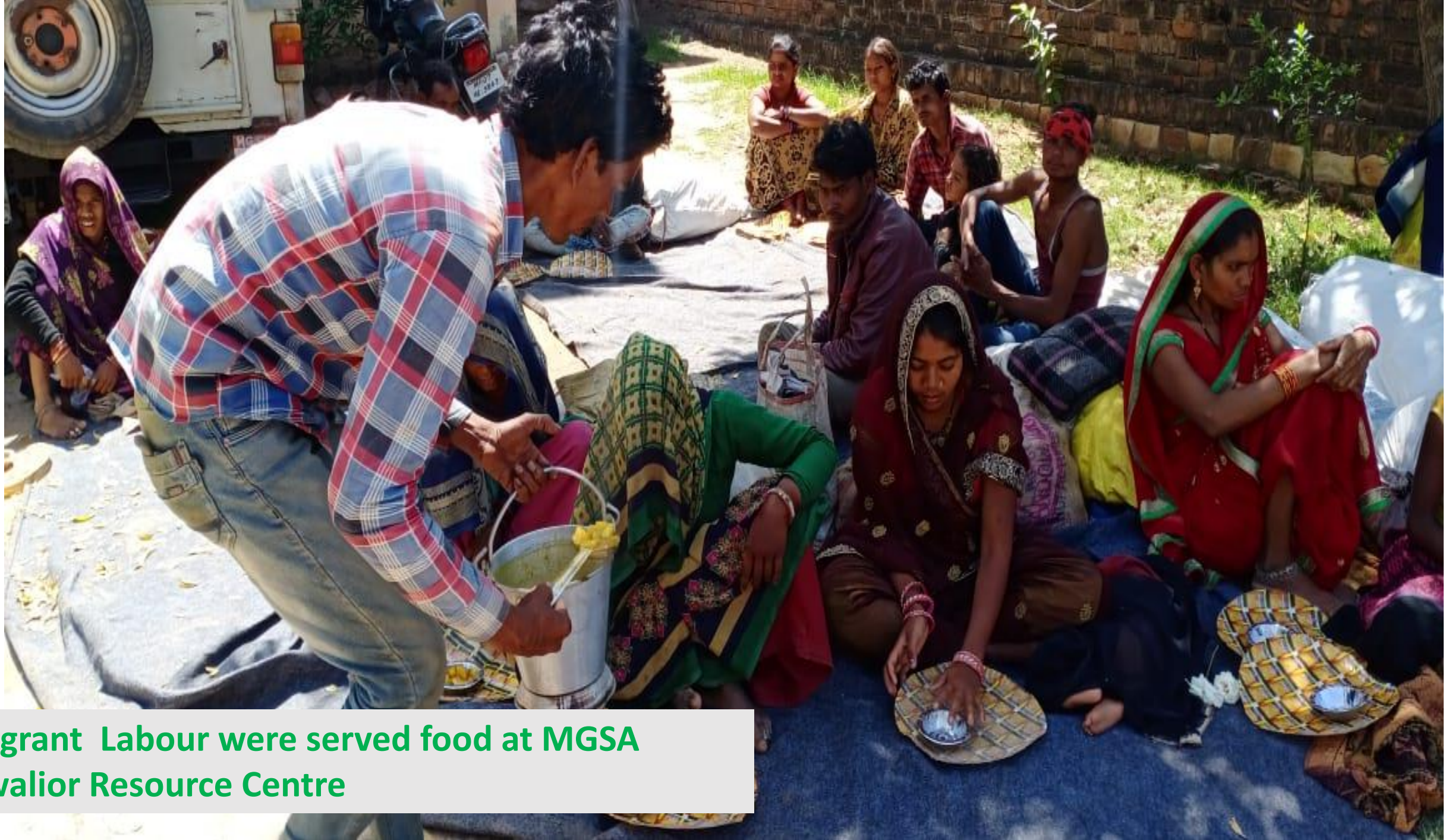
Migrant Labour were served food at MGSA Gwalior Resource Centre