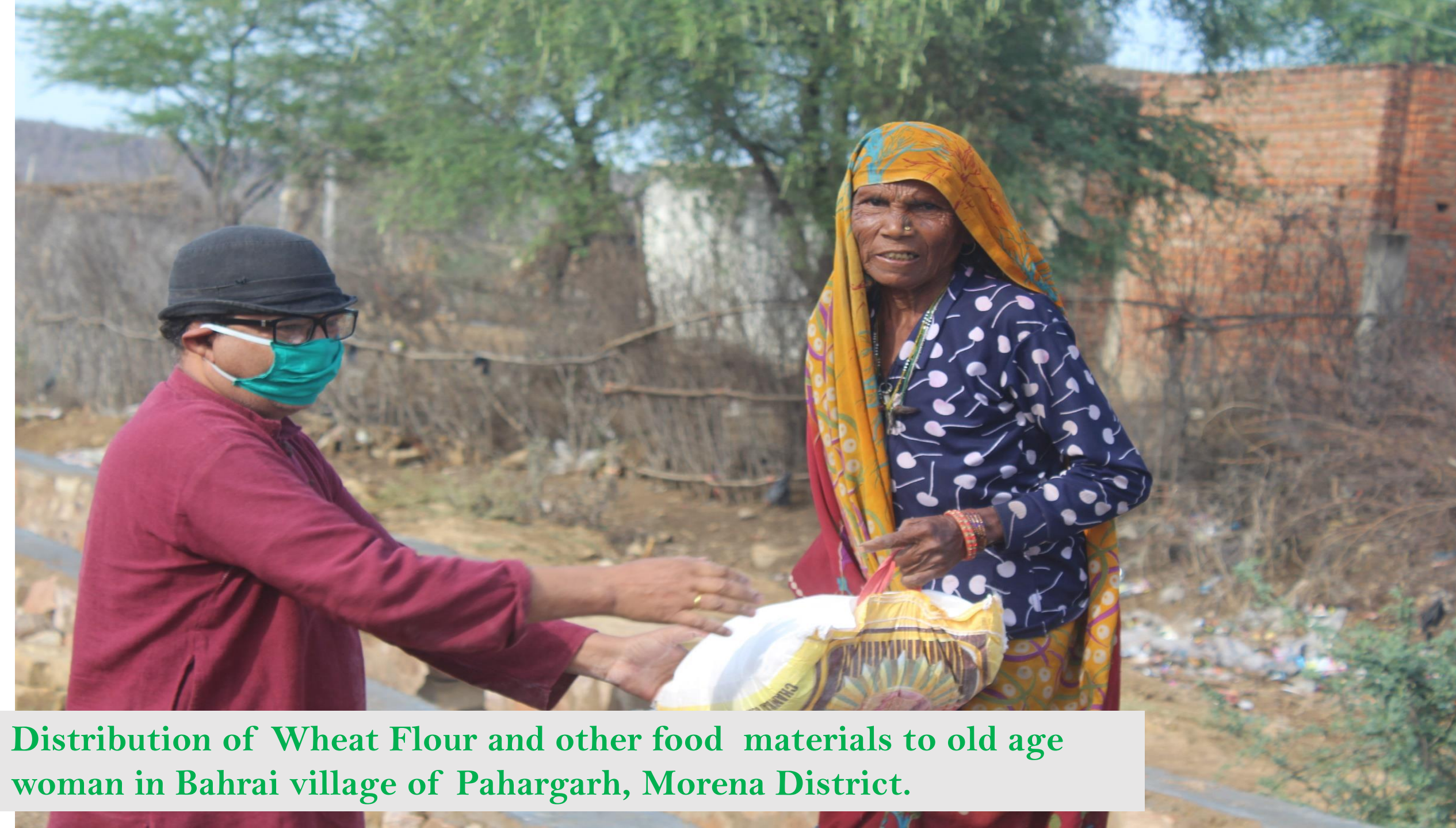
Distribution of Wheat Flour and other food materials to old age woman in Bahrai village of Pahargarh, Morena District.