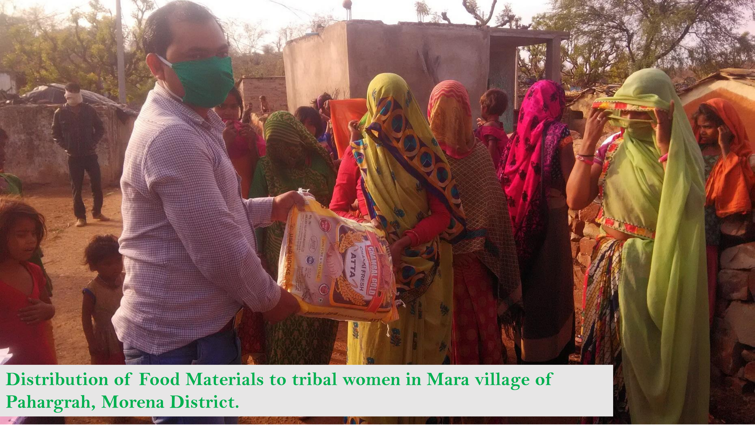
Distribution of Food Materials to tribal women in Mara village of Pahargrah, Morena District.