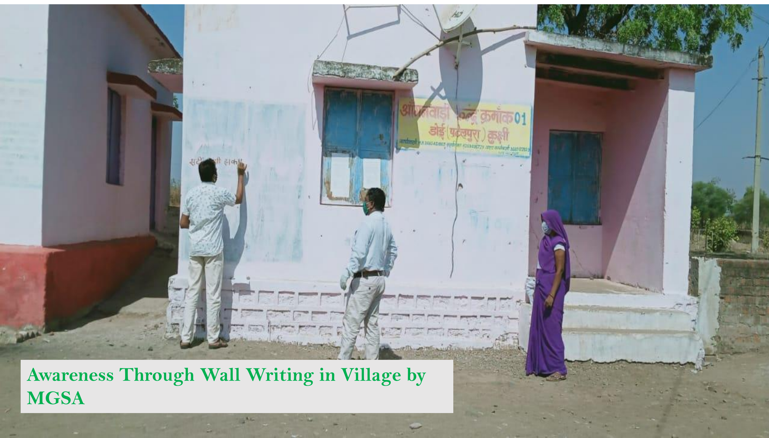
Awareness Through Wall Writing in Village by MGSA