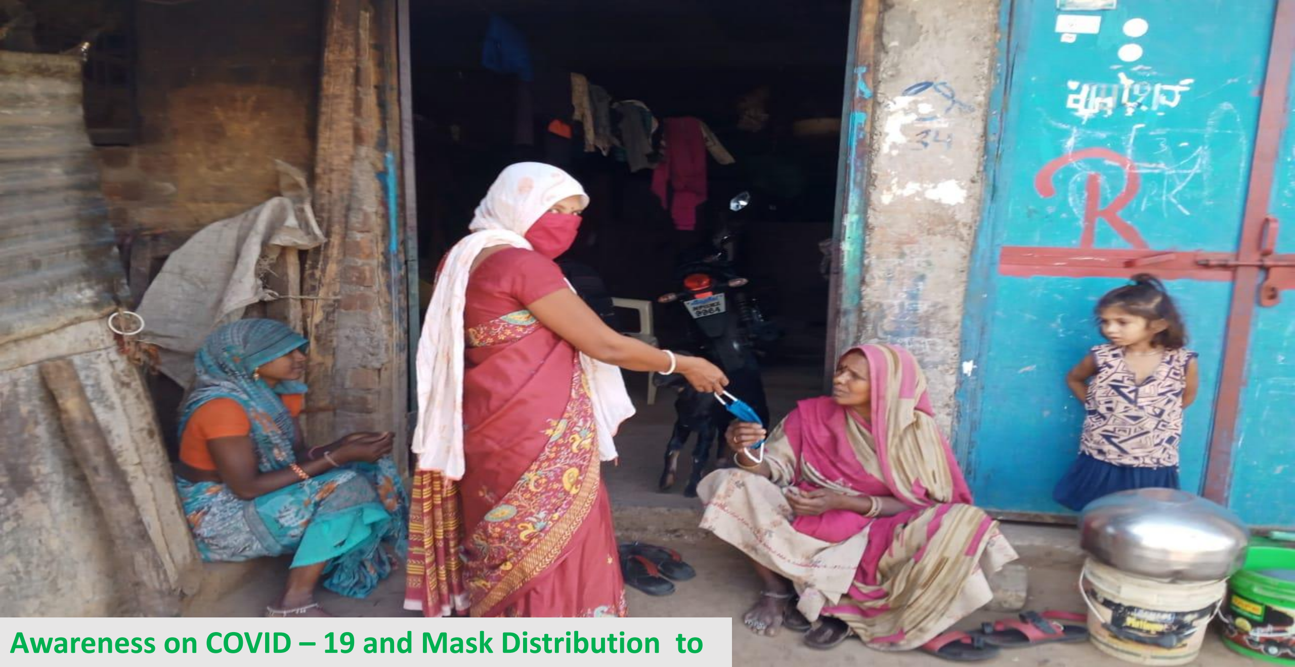
Awareness on COVID – 19 and Mask Distribution to Women by MGSA