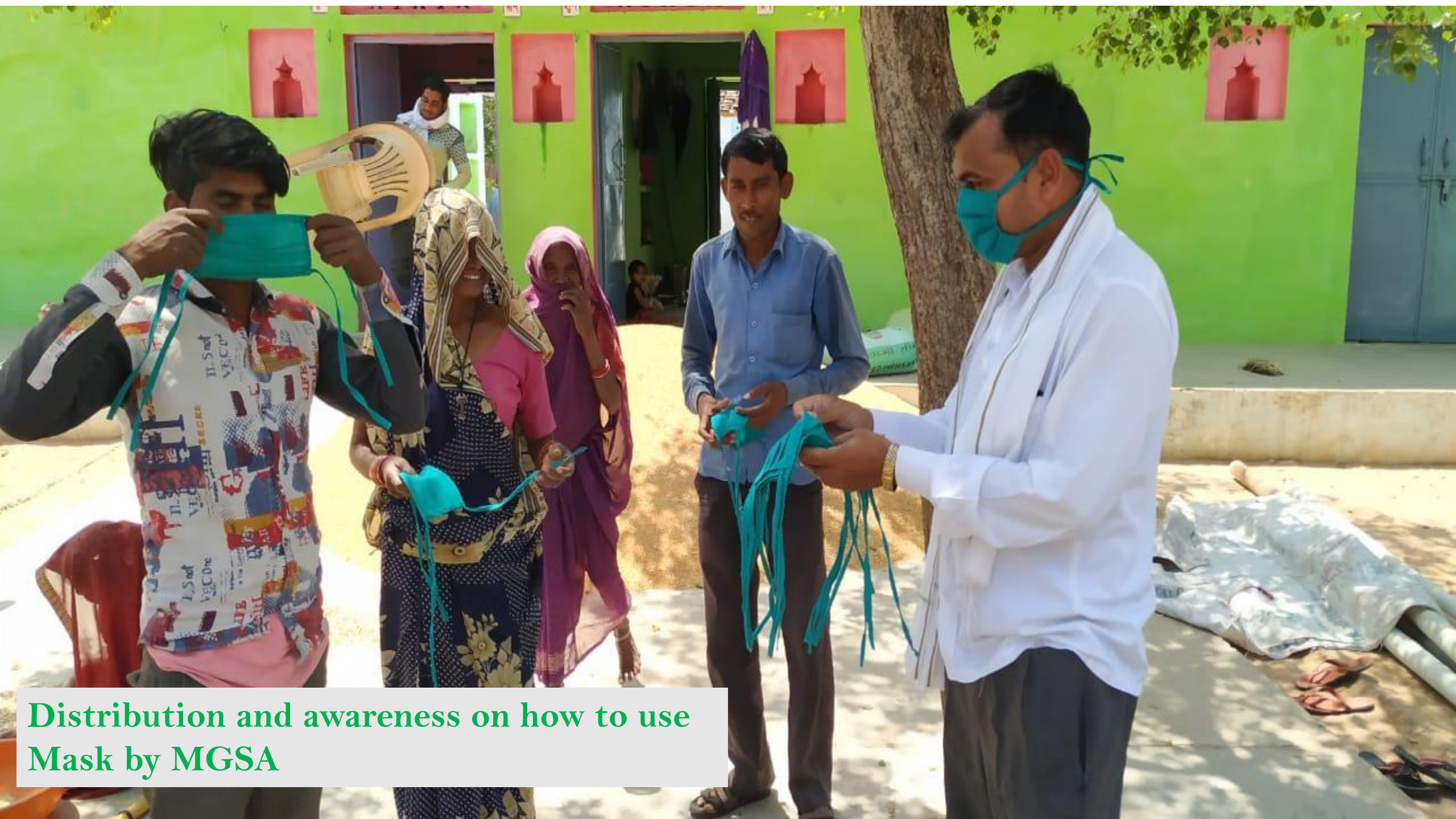
Distribution and awareness on how to use Mask by MGSA